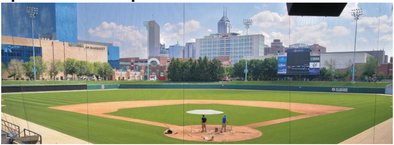
Please do NOT quote or cite without permission